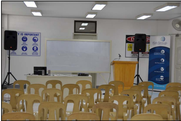
Room 6A (seminar setup)