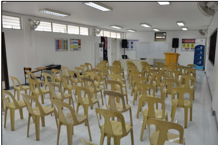
Room 6B (seminar setup)