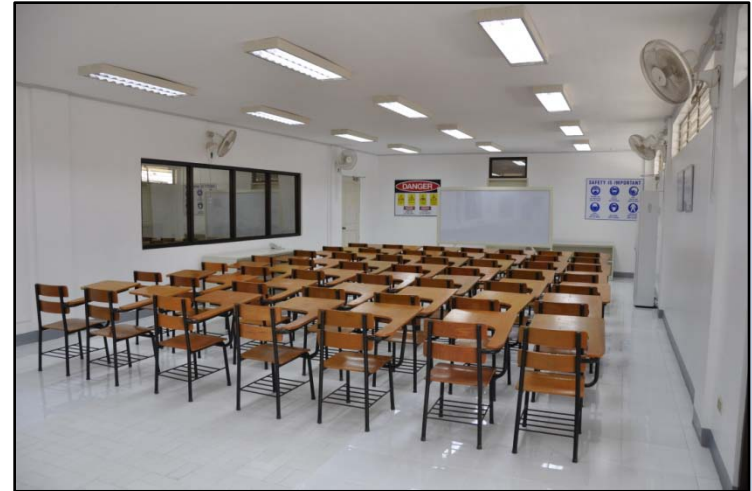
Room 6A (classroom setup)