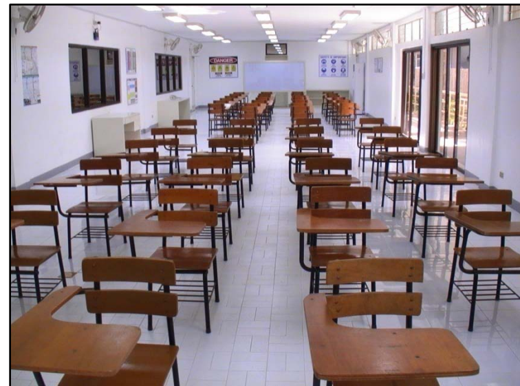
Room 6A & 6B (classroom setup)