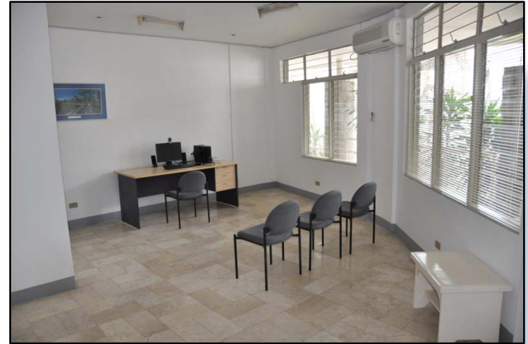
Video Conference Room